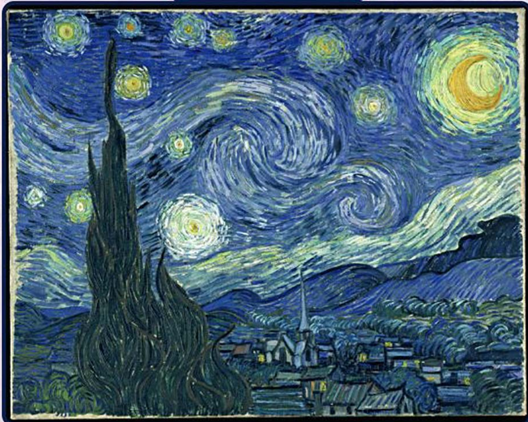
The Starry Night (1889)