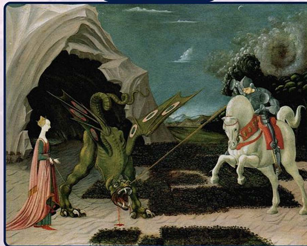
St George and the Dragon (1470)